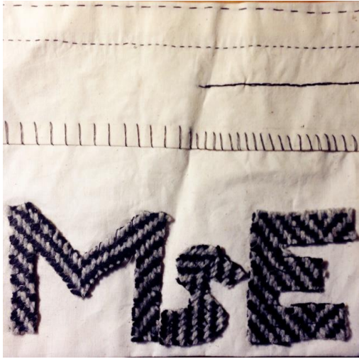
Simple sewing technics